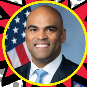
COLIN ALLRED FOR US SENATOR