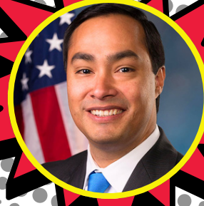
JOAQUIN CASTRO FOR CONGRESS