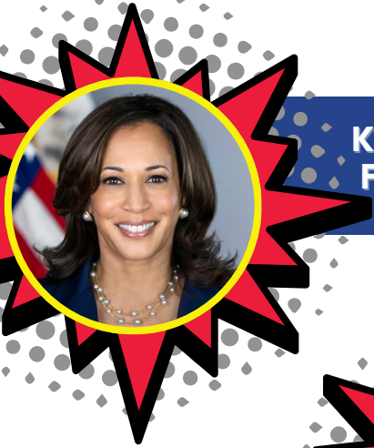
KAMALA HARRIS FOR PRESIDENT