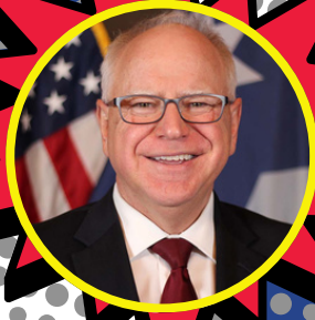
TIM WALZ FOR VICE PRESIDENT