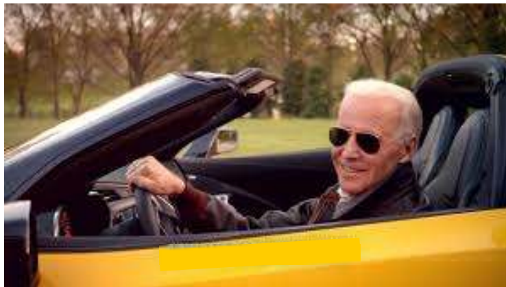
Biden after winning Georgia 4 times!